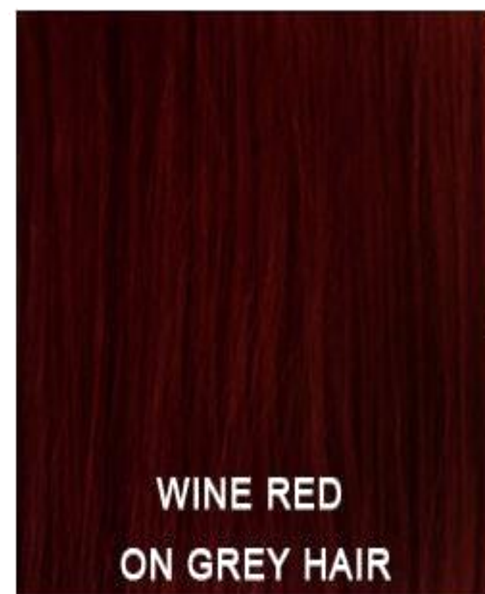
WINE RED ON GREY HAIR