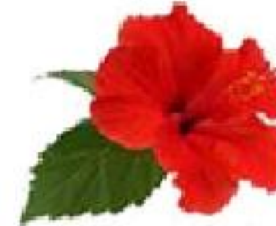
Hibiscus Powder (Hibiscus rosa-sinensis)