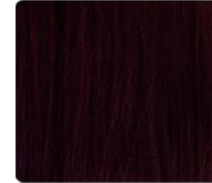
Herbal Rose Brown

Makes your hair beautiful and healthy 100% grey hair coverage No Ammonia, No PPD, No Barium Moisture free packing for long shelf life