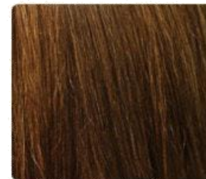
Herbal Light Brown