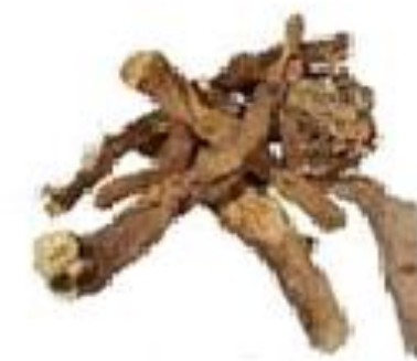
Manjistha (Rubia Cordifolia)