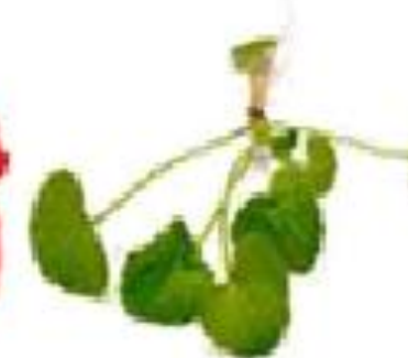
Brahmi (Bacopa Monniera)