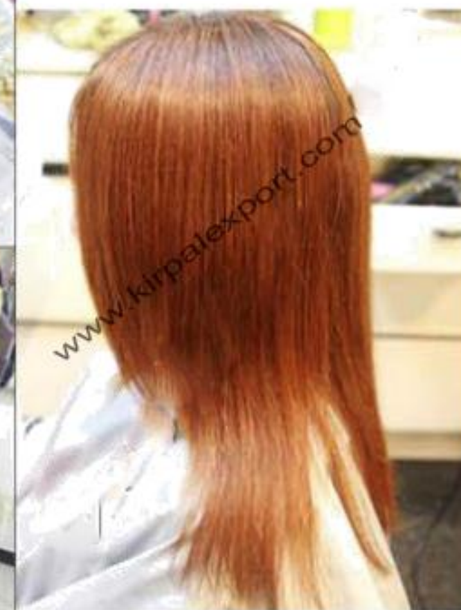
Henna Powder Treatment on Hair