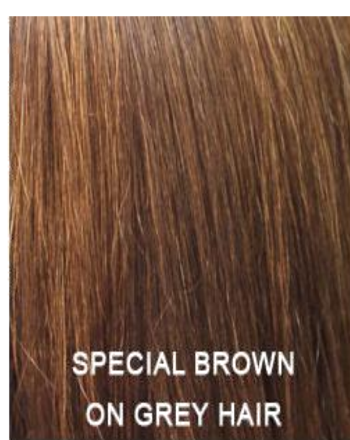
SPECIAL BROWN ON GREY HAIR