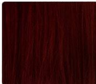
Herbal Wine Red