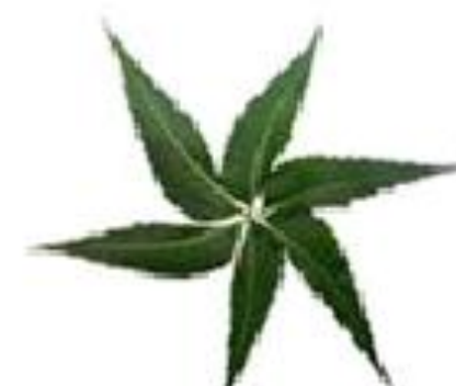
Néem (Azadirachta Indica)