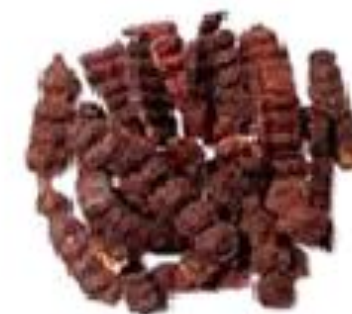
Shikakai (Acacia Concinna)