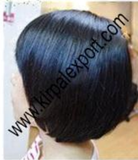
Indigo Hair Dye On Hair