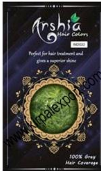
Our Indigo Hair Dye Box