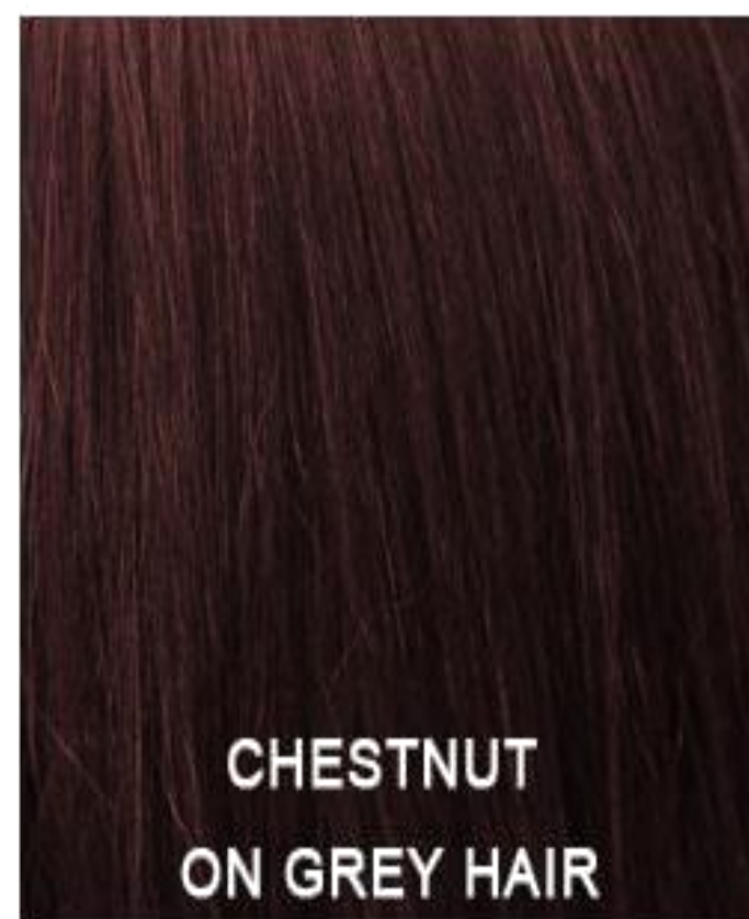
CHESTNUT ON GREY HAIR