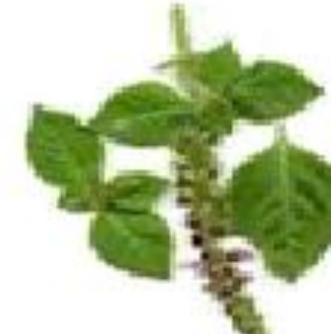
Tulsi - Basil (Ocimum Sanctum)