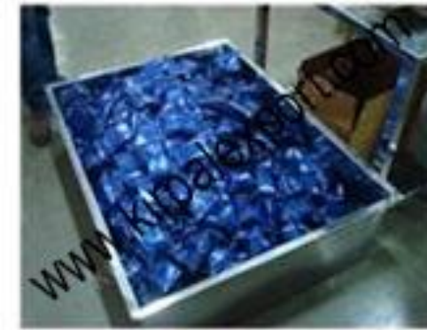
Indigo Hair Dye Pouches