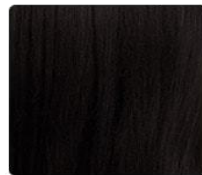
Herbal Dark Brown