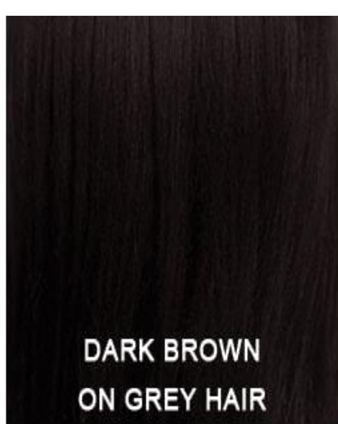
DARK BROWN ON GREY HAIR