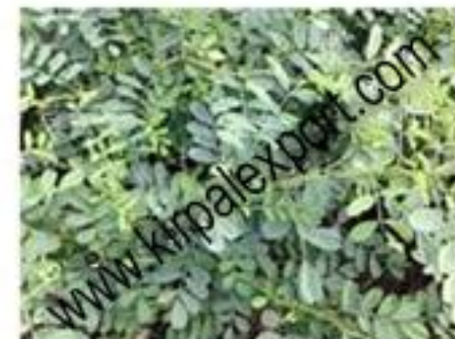
Indigo Leaf Plant