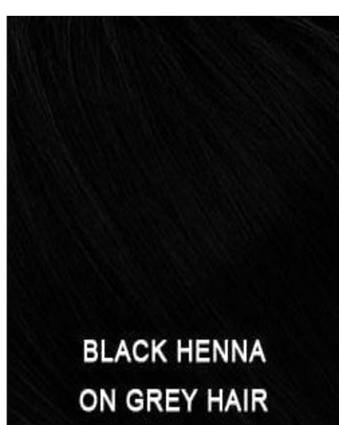
BLACK HENNA ON GREY HAIR