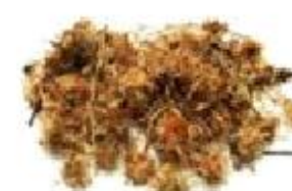
Arnica (Arnica Montana)