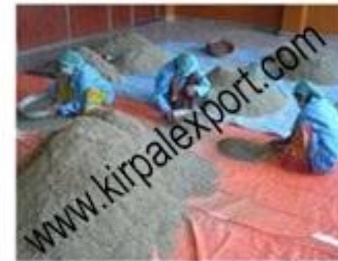
Indigo leaves cleaning