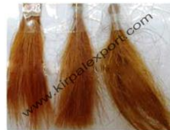
Henna Powder Patch Treatment