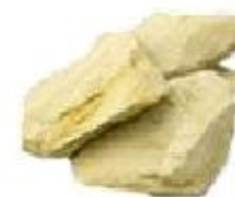
Multani Mitti (Fuller's Earth)