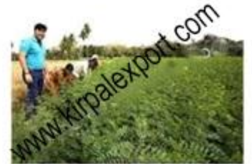
Keo Indigo Indigo Farm