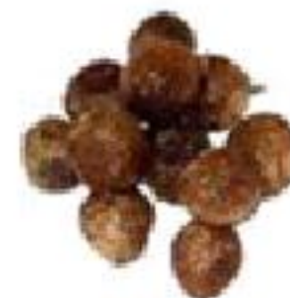
Reetha (soap nut) (Sapindus Mukorossi)