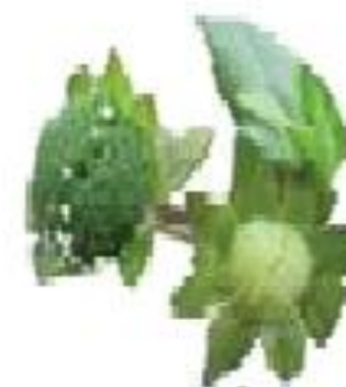
Bhringraj (Eclipta Alba)