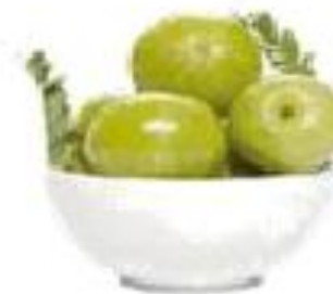
Amla (Emblica Officinalis)