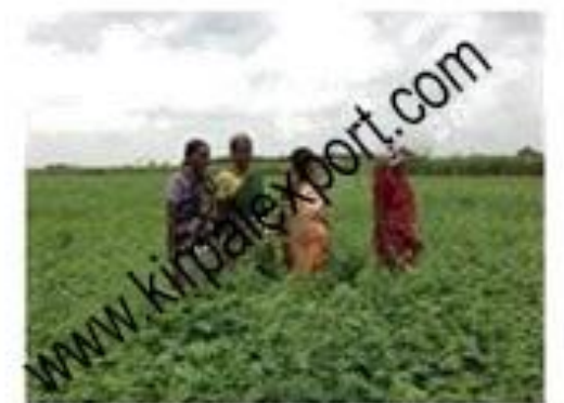
Keo Farmers in Indigo Farm