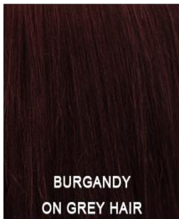
BURGANDY ON GREY HAIR