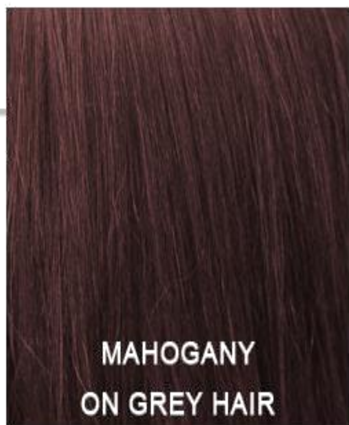
MAHOGANY ON GREY HAIR