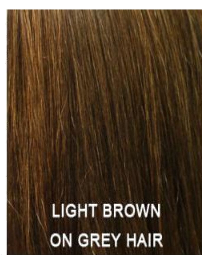
LIGHT BROWN ON GREY HAIR