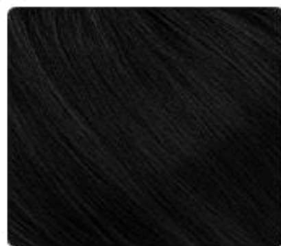
Herbal Soft Black