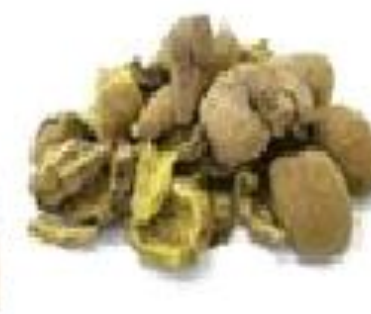
Baheda (Terminalia Bellirica)