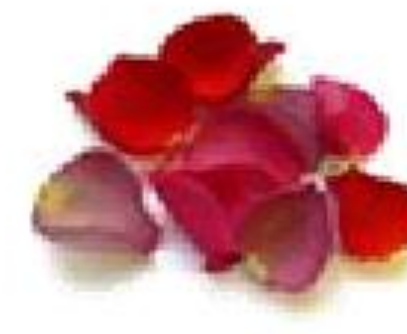
Rose Petal Powder (Rosa Gallica)