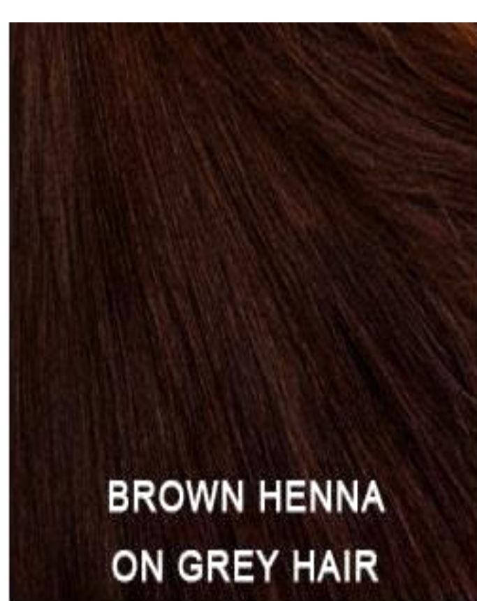
BROWN HENNA ON GREY HAIR