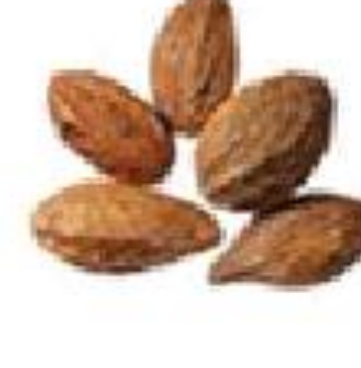
Harad (Terminalia Chebula)